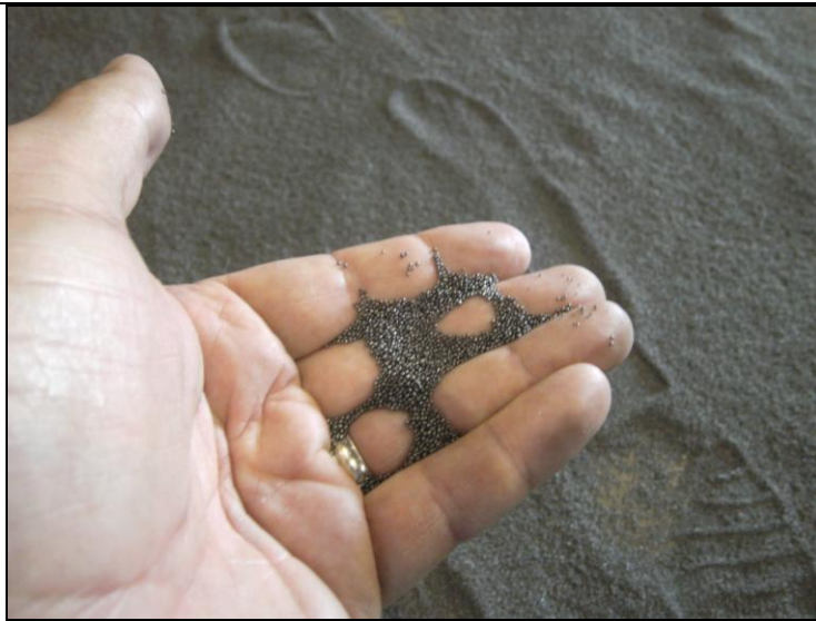
Steel Shot Media Used for Surface Preparation at a Fabrication Facility

If the project is a first time paint job, the steel members will be delivered to the construction site with the prime coat applied. When steel members arrive at the site, they need to be inspected to see if there was damage of the prime coat during shipment. Damaged places must be touched up prior to the application of any other coats. You must verify that touch-up paint is the same paint that was used in the shop.