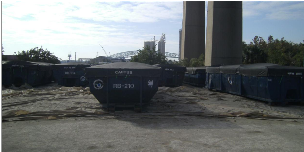
Spent Abrasive Media and Removed Paint Storage

Concerns associated with painting operations include worker safety, air and water pollution, control of overspray and disposal of contaminated waste. These concerns can have a major impact on public safety and so you must be familiar with all the specifications and regulations that govern these issues. You must bring violations to the attention of the Project Administrator immediately since they can result in serious injury or death of project personnel or the public.