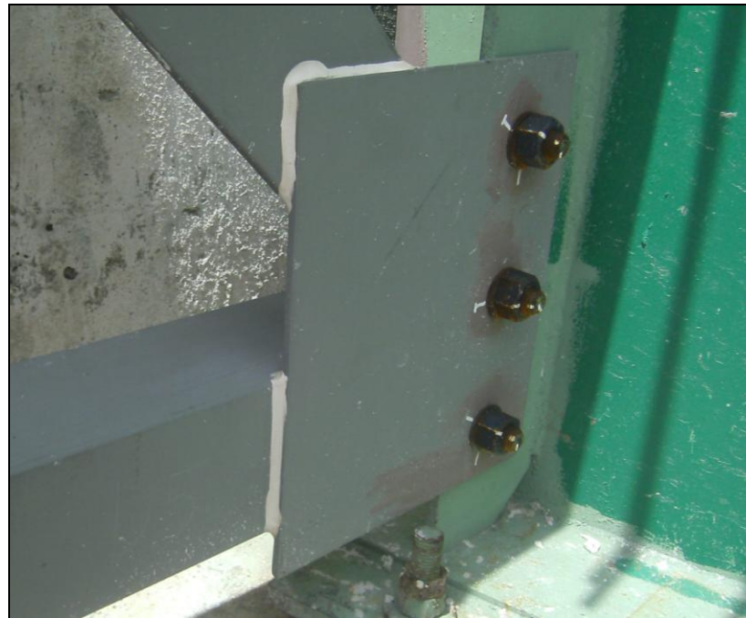
A Caulked Field Connection

The pattern to be followed in applying the paint should make it possible to get a uniform thickness not less than the thickness specified. There must be some overlapping at the edges of strips covered on successive strokes of the spray gun. The spray gun should be held at right angles to the surface being painted and at the correct distance away from it. All small cracks and cavities, such as those in back of crimped stiffeners and ground splice plates, which were not sealed watertight by the first coats of paint, must be caulked with an approved caulking compound. This caulking compound must be dry before the next coat of paint is applied.