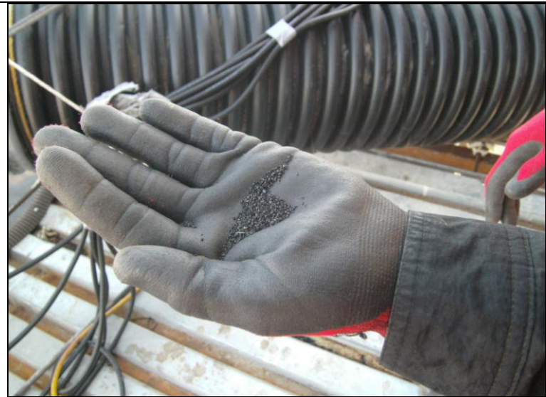
Abrasive Media Used for Surface at a Bridge Repainting Project