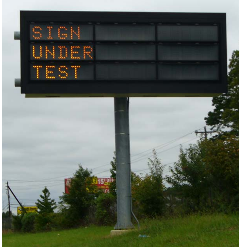
Figure A.1 – Front of a North Carolina DMS Structure