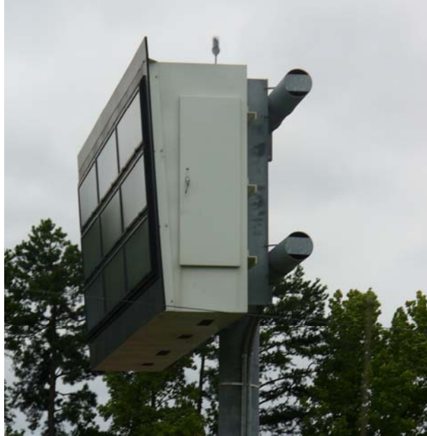
Figure A.3 – Back of a North Carolina DMS Structure