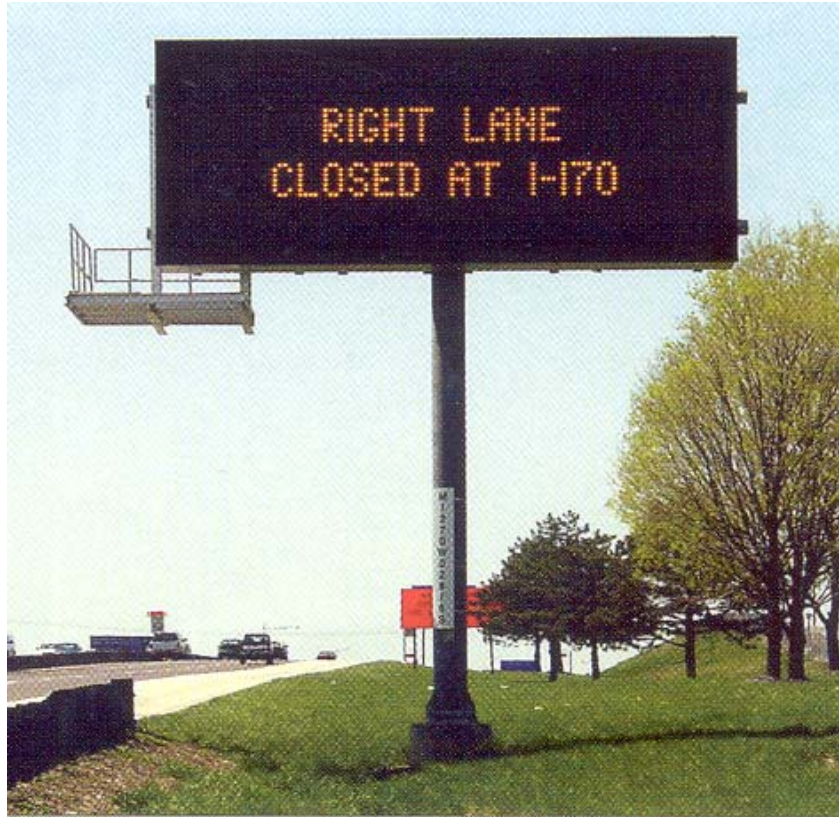
Figure A.5 – Missouri DMS Structure i