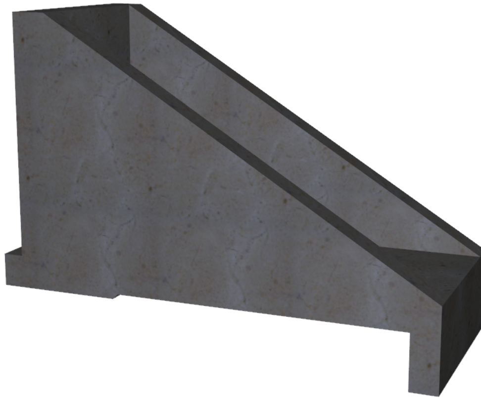
INDEX 430-010 U-Type Concrete Endwalls With Grates - 15" to 30" Pipe (1:2 Slope - 30" Pipe Without Baffles Shown)