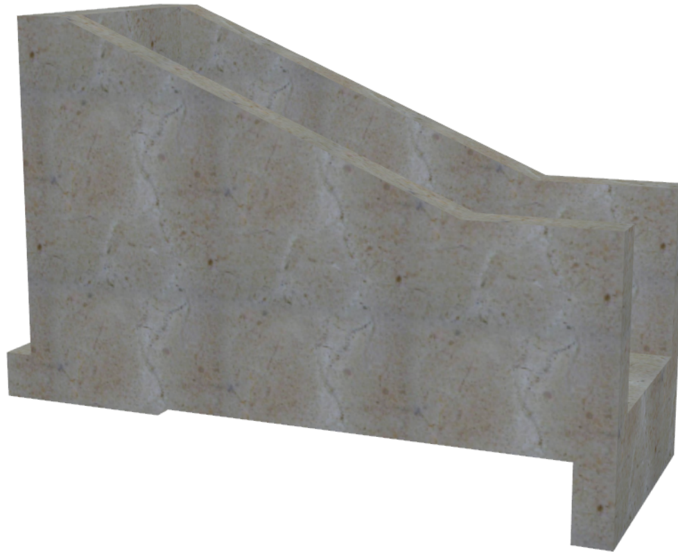
INDEX 430-011 U-Type Concrete Endwalls - Baffles and Grates Optional - 15" to 30" Pipe (1:2 Slope - 30" Pipe With Baffles Shown)