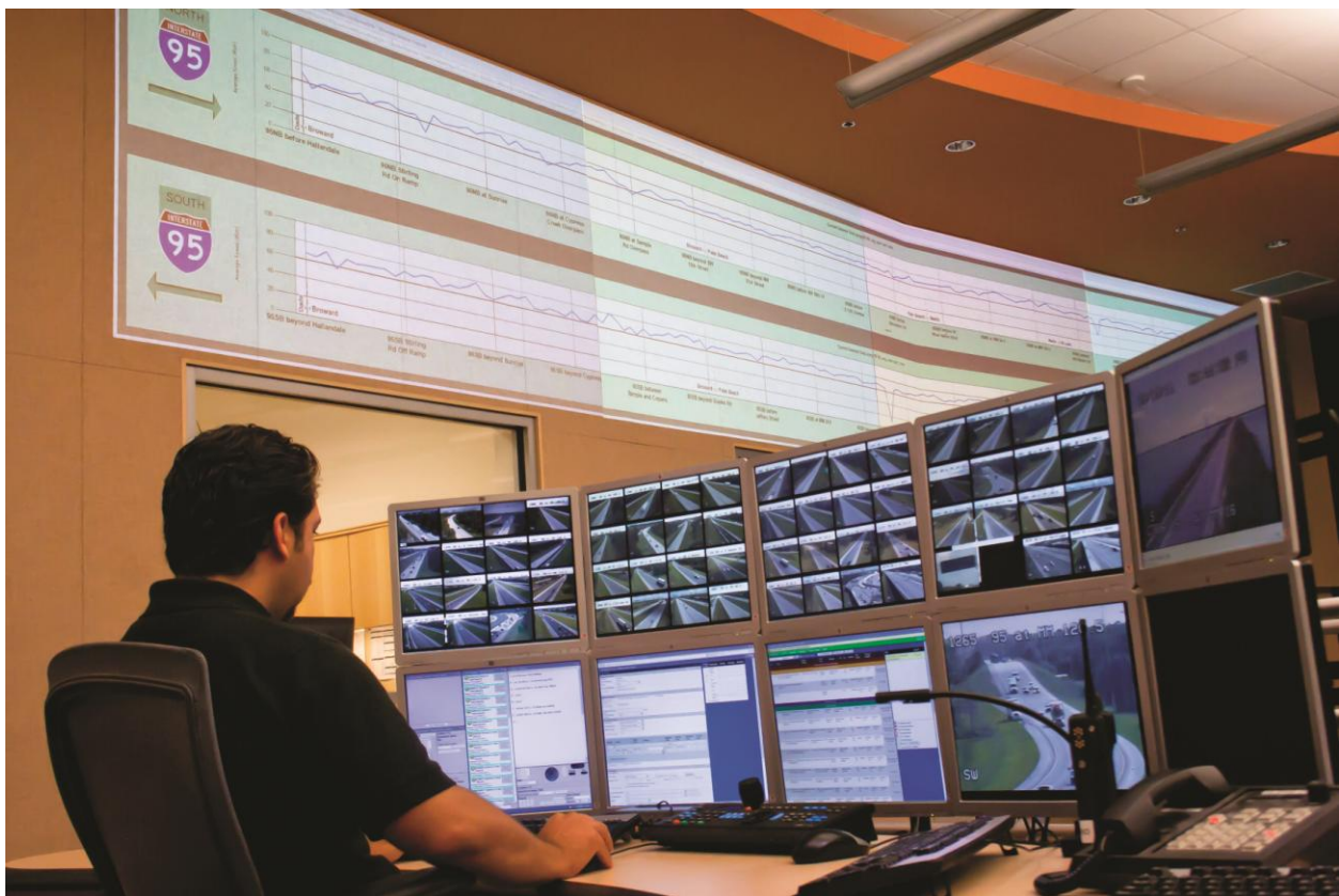
Figure 2: Off-the-shelf Software Video Decoder

Currently, an off-the-shelf software decoder could be installed on the workstation as shown in Figure 1. However, without this proposed integration into the operator map, a separate list of camera names and multicast addresses must be maintained in a separate software application database, in a look-up table, or memorized. Additionally, the decoder must be launched and controlled independently from the SunGuide software. Integration of this component into the SunGuide software graphical user interface (GUI) will reduce the configuration, maintenance, and run-time operational effort required for this capability.